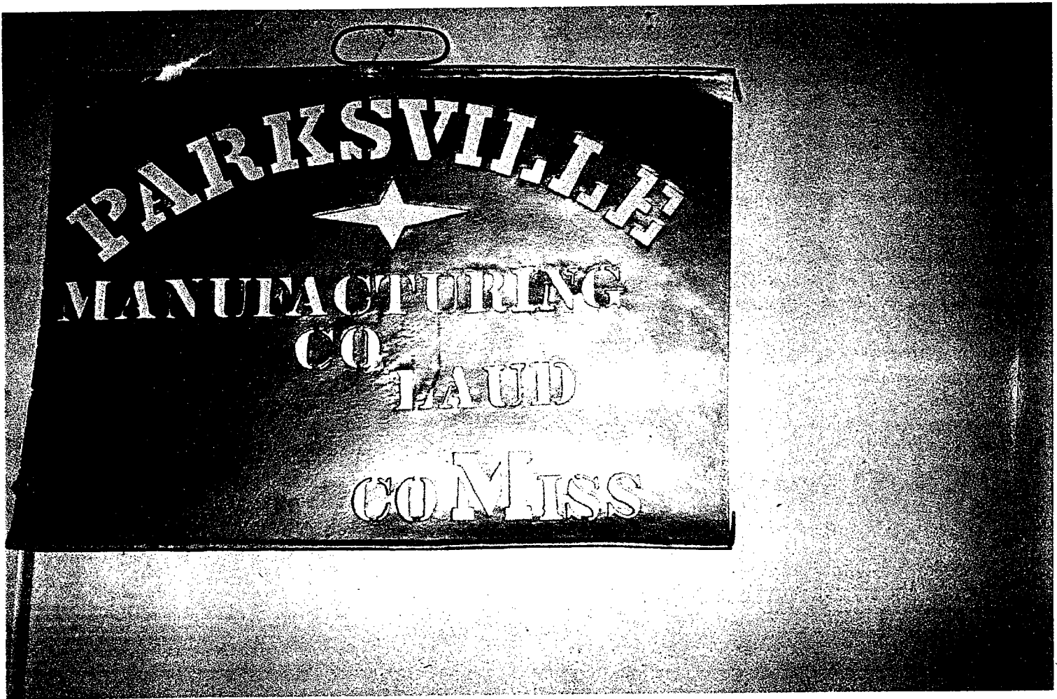
Parks Family History - Brass stencil