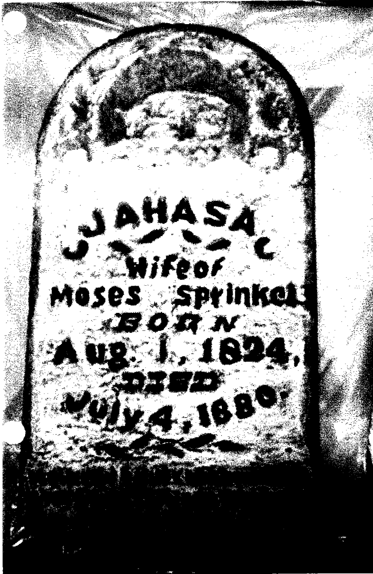
Tombstone as it looked after being cleaned up and chalked. Now readable