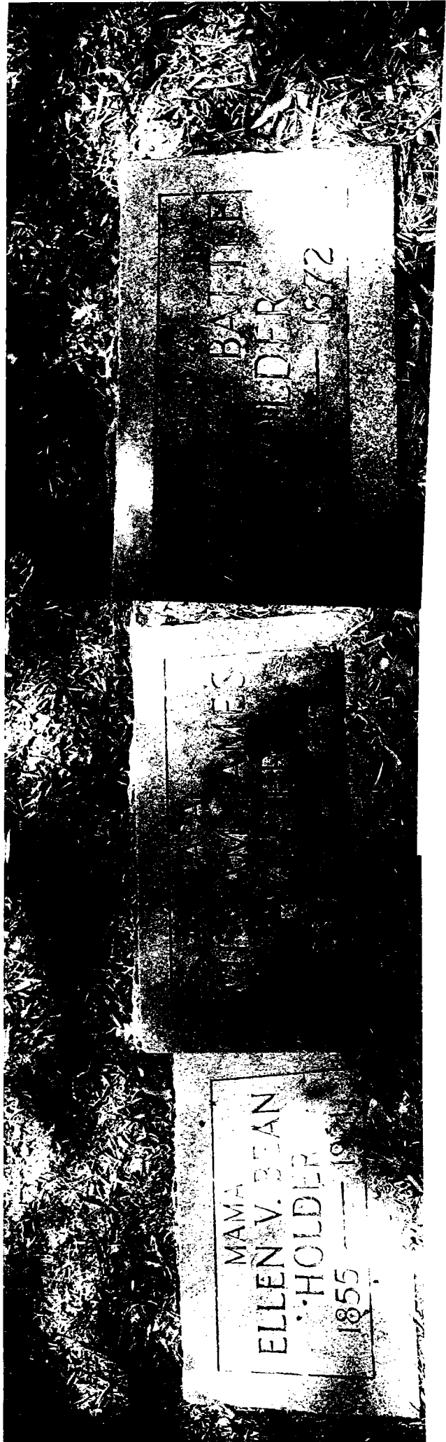
These graves are in SILKMAN, SUMTER CO, ALABAMA